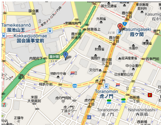
Nadao Hall bldg